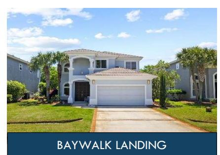
Beds: 4 Baths: 3 SqFt: 2,599 119 Dominica Court, Miramar Beach $625,000

For more information about the featured listings above or other homes on the market - stop by our office, give us a call, or reach us by web!