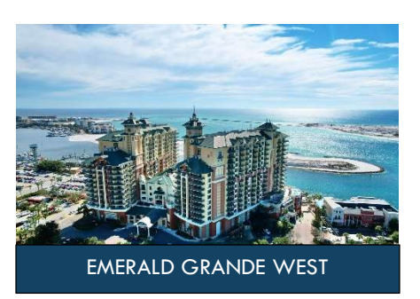
Beds: 3 Baths: 3 SqFt: 1,556 10 Harbor Blvd, Unit W527, Destin $999,999

Beds: 2 Baths: 2 SqFt: 1,274 9800 Grand Sandestin Blvd 5701/5703, Destin $609,000