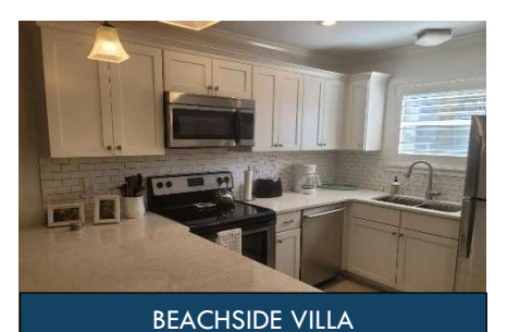
Beds: 2 Baths: 2 SqFt: 792 11 Beachside Dr, Unit 412, SRB $599,000