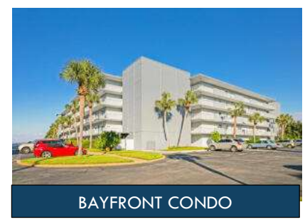
Beds: 2 Baths: 2 SqFt: 1,020 3857 Indian Trail Dr, Unit 414, Destin $349.900

For more information about the featured listings above or other homes on the market - stop by our office, give us a call, or reach us by web!