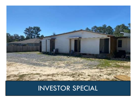
Beds: 7 Baths: 6 SqFt: 2,094 73 Santana Drive, SRB $499,900