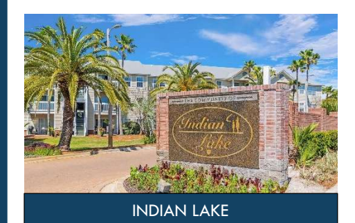
Beds: 1 Baths: 1 SqFt: 743 4000 Dancing Cloud Ct, Unit 22, Destin $200,000