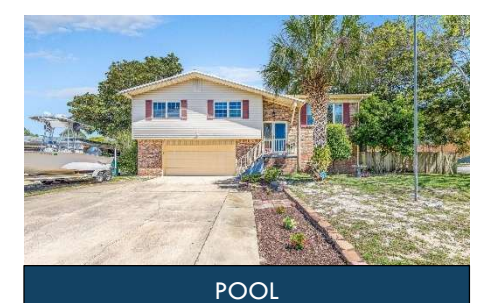
Beds: 3 Baths: 2 SqFt: 2,289 621 Sea Oats Drive, Destin $565,000