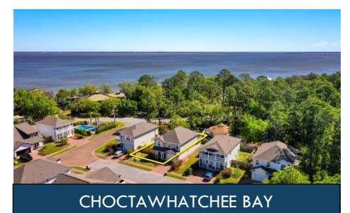
Beds: 4 Baths: 3.5 SqFt: 2,275 19 Tranquility Court, SRB $575,000