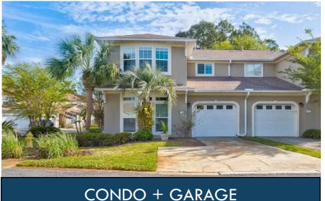
Beds: 3 Baths: 2 SqFt: 1,704 126 S Shore Drive #28, Miramar Beach $475,000