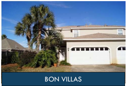
Beds: 3 Baths: 2.5 SqFt: 1,736 126 S Shore Drive #56, Miramar Beach $395,000